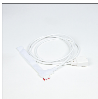
SpO 2 SENSOR L-SHAPE