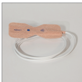
SpO 2 BUTTERFLY SENSOR