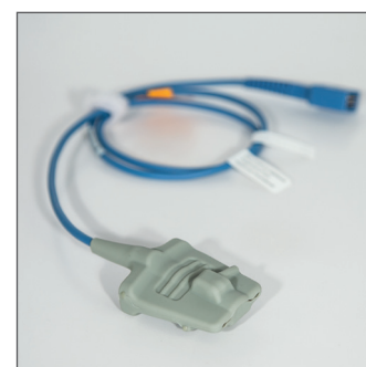
SpO 2 SENSOR SOFT CAP „FROG SENSOR“