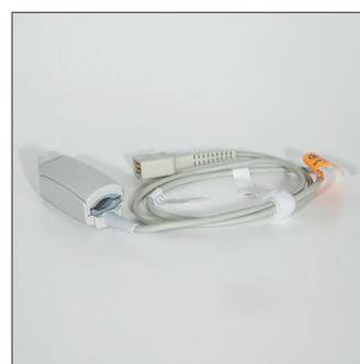
SpO 2 SENSOR FINGERSENSOR